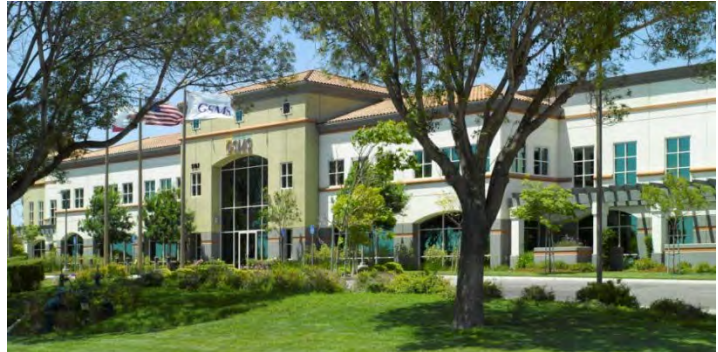
Pictured: GSMS, Incorporated facility in Camarillo, California

The VITAS Community Connection is a nonprofit organization that allows family and friends of VITAS to honor the memory of their loved one by making a special gift. One hundred percent of proceeds makes a difference in the community by supporting the special needs of our hospice patients and their families, as well as charitable organizations throughout our local community. To learn more, visit www.vitascommunityconnection.org