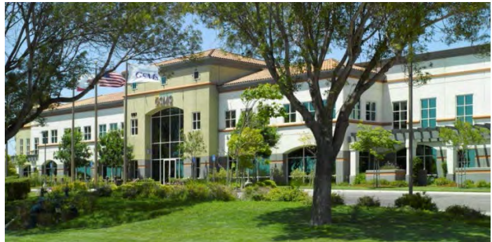
Pictured: GSMS, Incorporated facility in Camarillo, California

The VITAS Community Connection is a nonprofit organization that allows family and friends of VITAS to honor the memory of their loved one by making a special gift. One hundred percent of proceeds makes a difference in the community by supporting the special needs of our hospice patients and their families, as well as charitable organizations throughout our local community. To learn more, visit vitascommunityconnection.org .